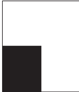
Quarter-page: 3.70" wide x 5.25" deep

Please complete form below and return by email