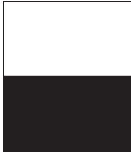
Half-page: 7.5" wide x 5.25" deep